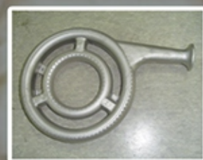
100% Aluminium Burner