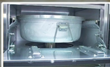
Rolling Rail to put in/out Kettle easier & always fit in to position