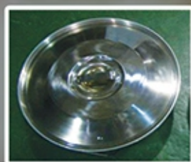
Special Protective Aluminium Coating Kettle