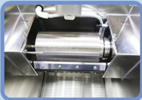
ANTI BACTERIAL SYSTEM